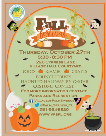
Fall Festival Flyer

food, games and prizes, music, and crafts. There will also be judges on hand ready to crown first, second, and third place winners of our costume contest! Again this year, the G-Star School of the Arts will produce a Haunted Hallway that's sure to get your heart racing. There will be a "no-scare" hour for the little ones from 5:30 - 6:30 p.m. and then the real fun begins from 6:30 - 8:30 p.m. for those brave enough to enter!