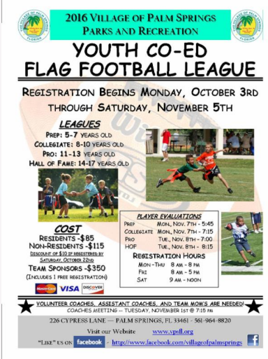
Flag Football Flyer

non-residents. The league is open to boys and girls ages 5 - 17. Player evaluations begin Monday, November 7th and practices will begin on Saturday, November 12th. Volunteer coaches are needed and there will be a coaches meeting on Tuesday, November 1st at 7:00 p.m. in the Parks and Recreation offices.